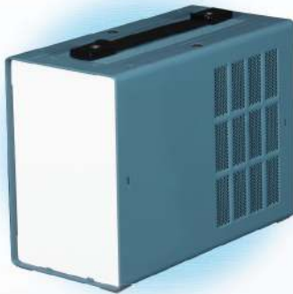
▶ Optional carrying straps